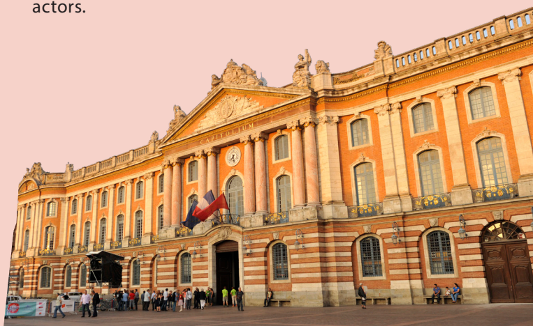
Place du Capitole.

Toulouse is committed to the cinema, with four Art et Essais cinemas and France's second-largest Cinémathèque, and almost 30 festivals throughout the year. They showcase foreign cinema, emerging talent, heritage works and genre films. Each film festival is an opportunity to create a festive atmosphere with concerts, shows and discussions with directors and actors.