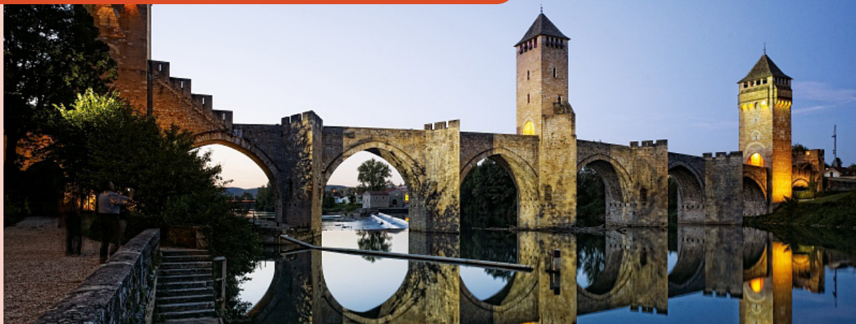
Valentré Bridge in Cahors.