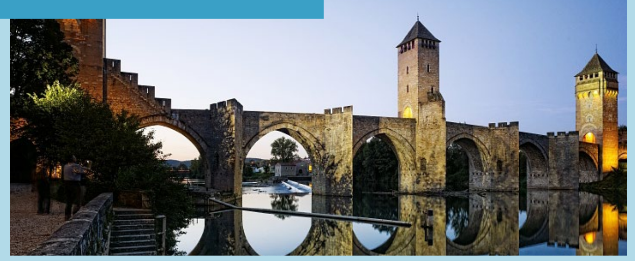
Valentré Bridge in Cahors