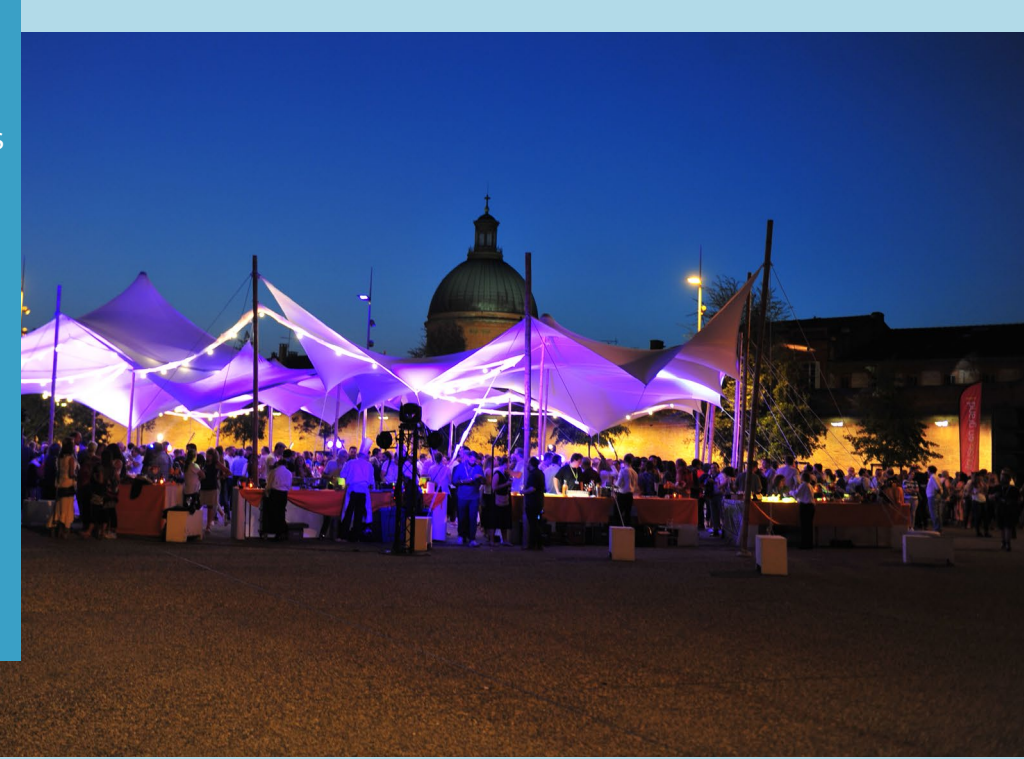
Cartoon Forum's Welcome Dinner

It is a city of innovation , thanks to research on aeronautics, space, information technology and nanotechnologies.