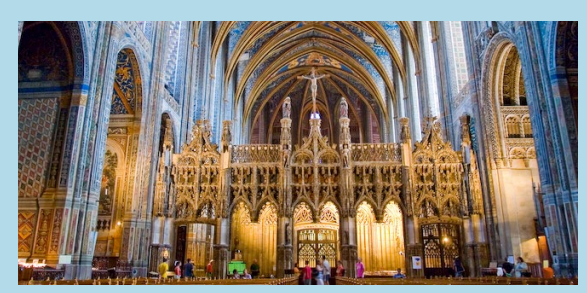
Sainte-Cécile Cathedral

Considered for its gastronomy and its good food, for its art of living, the dynamism of its cities and its two metropolises, Occitanie can only allure and convince. It is logically today one of the principal tourist destinations of France, with a branch of industry that represents nearly 87,000 jobs and which the Region strongly supports.