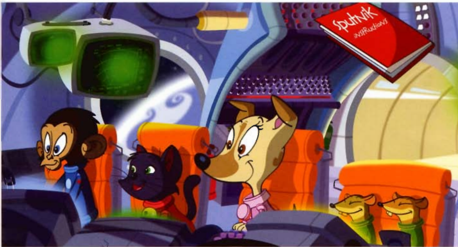
Clockwise from top left: Silly Bitty Bunny , Ella and Aleks and Laika, Space Adventures

EU-accession states and countries that have less developed animation sectors.