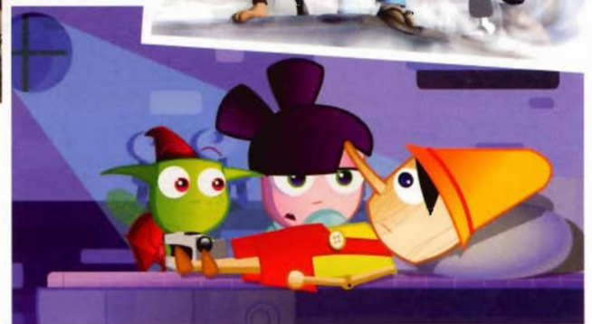
Previous Cartoon Forum pitches that have since been picked up by broadcasters, clockwise from top left: Alphanim's Hairy Scary , TV loonland's Raymond , Tiger Aspect's Tinga Tinga Tales , Aardman's Chop Socky Chooks , Imira's Sandra the Fairytale Detective , Monster Animation's Fluffy Gardens and Jam Media's Roy TBI