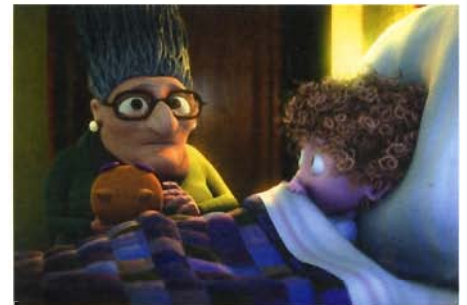
Clockwise from top left: Q Pootle, Skybabies, Granny O'Grim, Krazy Kathy and Black to the Moon