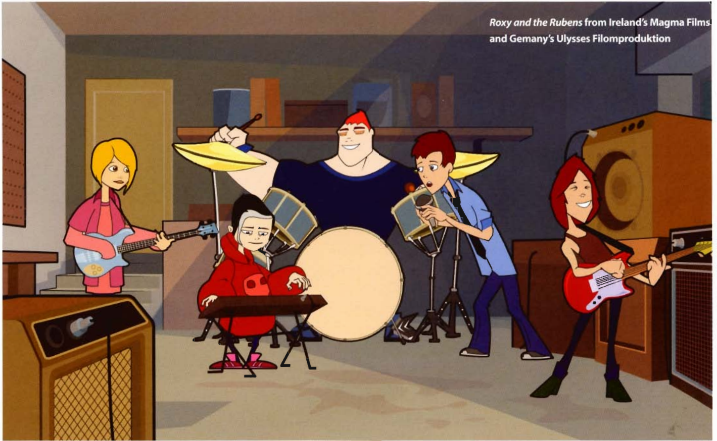
Roxy and the Rubens from Ireland's Magma Films and Gemany's Ulysses Filomproduktion