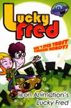
Leon Animation's Lucky Fred