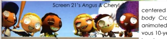
Screen 21's Angus & Cheryl