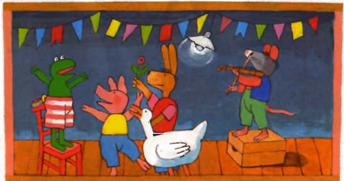
Max Velthuijs' classic books transition to the small screen in Frog and Friends

Netherlands-based production company Telescreen is turning Max Velthuijs' popular Frog and Friends books into a 26 x seven-minute series that should be delivered by summer '07.