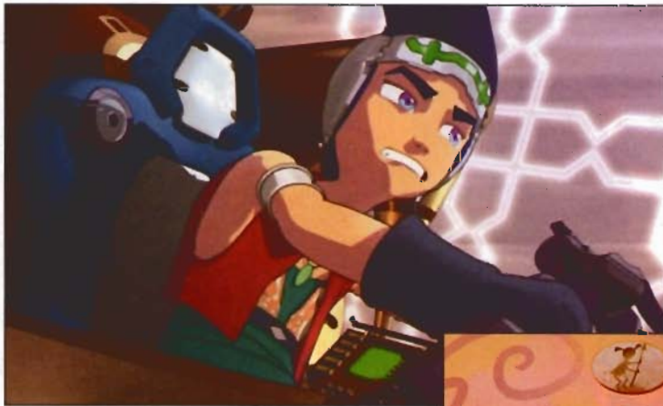
Sinbad gets a futuristic makeover in a new action-adventure series from Paris, France's Strapontin (above), and Cardiff, Wales-based Calon's Ig features a prehistoric preschooler discovering the world (right)

Strapontin from Paris, France will be shopping its new 26 x 24-minute action-adventurer around the Pyrenees.